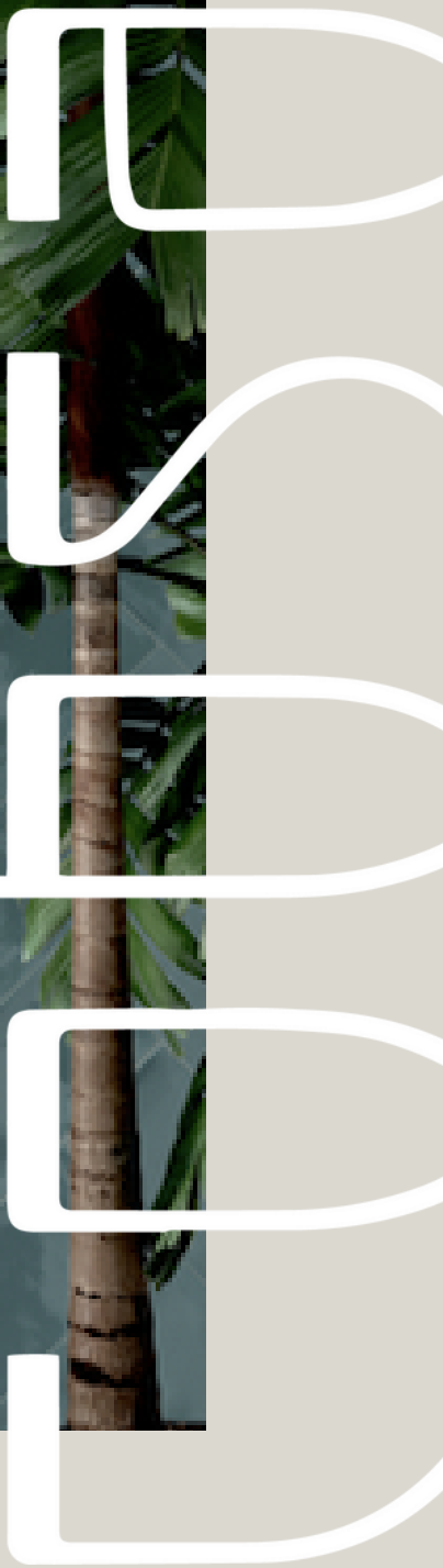
Atlanta, WHITE + SKY